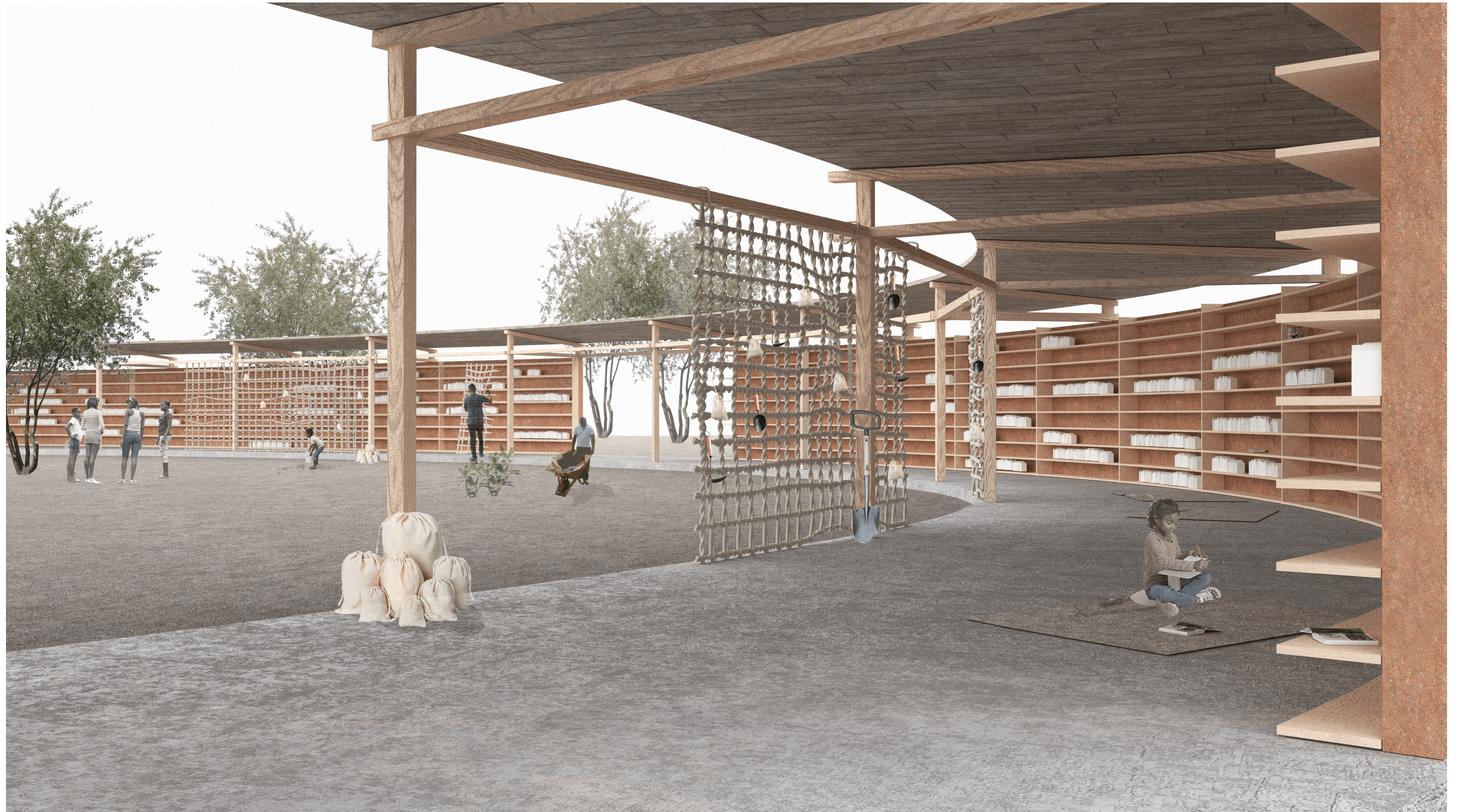
Perspective, looking at the gathering area